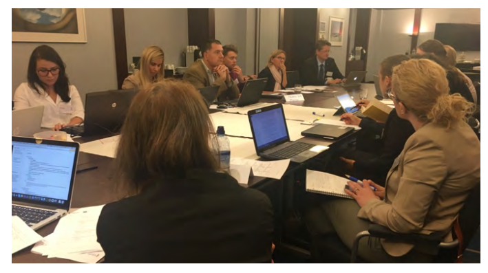
FIGURE 1 | eHAction WP 4 Workshop

On Thursday, October 18th, 29 experts from 18 different countries flew to Amsterdam to discuss and work on 'patient empowerment'.