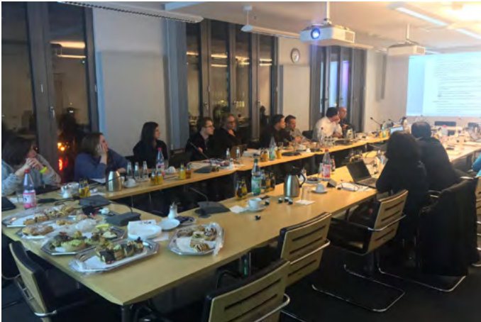
FIGURE 1 | eHAction WP 6 Workshop, Berlin