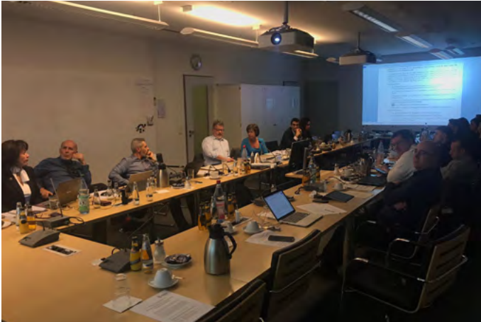
FIGURE 2| eHAction WP 6 Workshop, Berlin