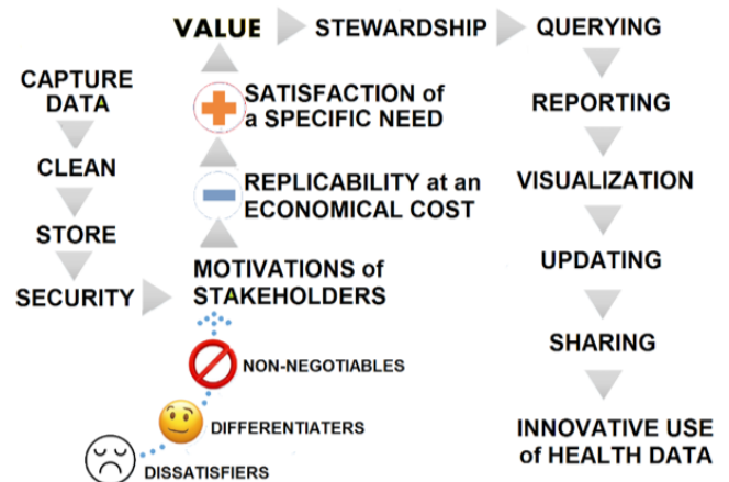
FIGURE 1 | Drivers of converting data into innovation

In the frames of preparing the work for delivering the report on identified cross-border use cases for innovative use of health data experts of the member states had a discussion and agreed on the methods of literature review, interviews, a questionnaire and the timetable for undertaking these tasks.